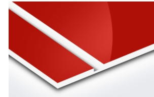
LAZ-0011-G Gloss Red/White