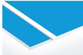
LAZ-0020 Carolina Blue/White