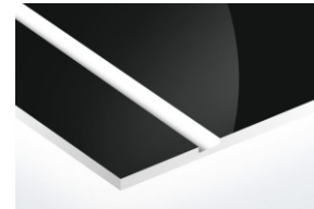
LAZ-0001-G Gloss Black/White