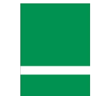
LAZ-0009 Bright Green/White