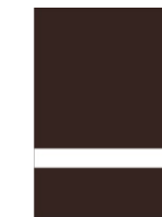
LAZ-0016 Dark Brown/White