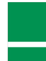
LAZ-0009 Bright Green/White