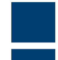
LAZ-00014 Navy Blue/White

PMS Color Matches Custom Colors Low Minimums