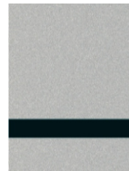
LHH-0030 Smooth Silver/Blk