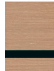
LHH-0026 Brushed Copper

PMS Color Matches Custom Colors Low Minimums