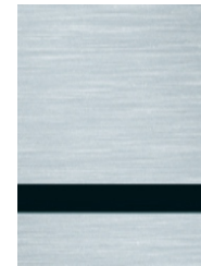
LHH-0035 Brush Silver/Blk