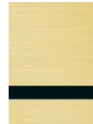
LHH-0033-M Matte Euro Gold